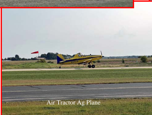
Air Tractor Ag Plane