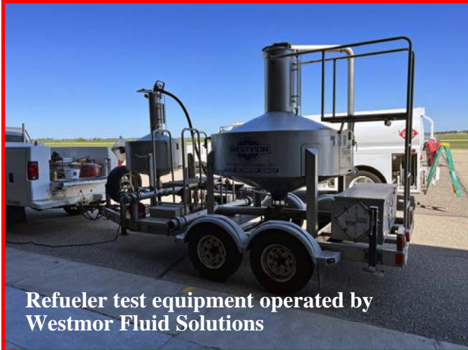
Refueler test equipment operated by Westmor Fluid Solutions

Solutions in late August, which is required to maintain fuel licenses. The city of New Richmond safety committee also inspected the two airport maintenance buildings located in the south hangar area in September. I'm happy to report no violations. State of Wisconsin inspectors checked out the fuel farm on the south end of the airport this month and lastly, the FAA was on site to inspect our automated weather equipment. Check, check, check. We're all good.