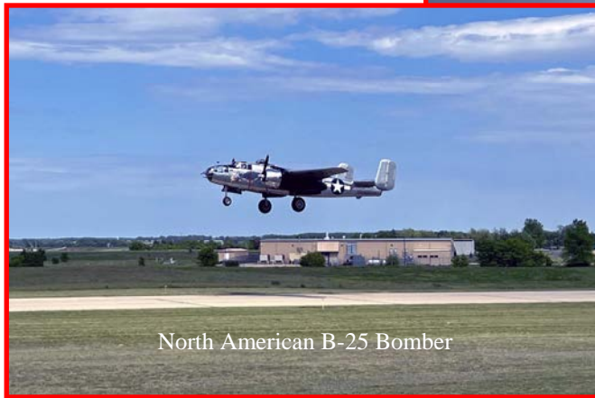
North American B-25 Bomber