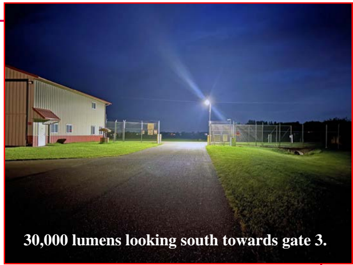
30,000 lumens looking south towards gate 3.