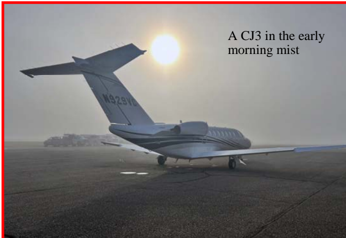
A CJ3 in the early morning mist