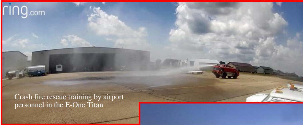
Crash fire rescue training by airport personnel in the E-One Titan