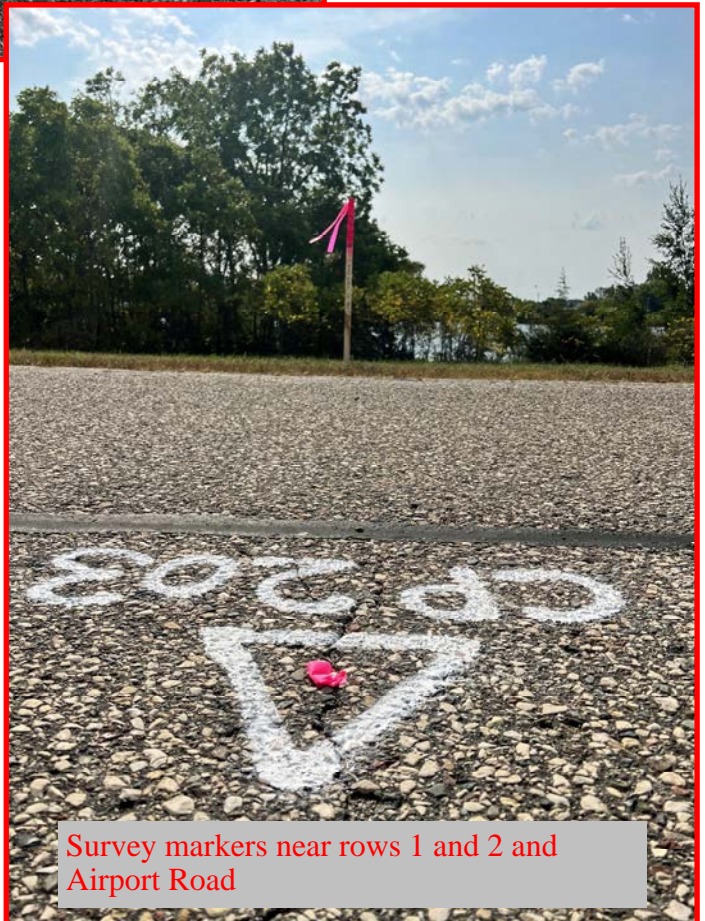
Survey markers near rows 1 and 2 and Airport Road

This reconstruction project is fairly straight forward and should go smoothly. There will be some access limitations next spring for hangar owners and businesses located in the project area. Airport engineers and management will help to minimize the impact. There will be plenty of communication well in advance of the project I promise. I anticipate self service fuel to be unavailable for about two weeks during the project. Thankfully, East Metro has the new avgas refueler to handle the demand via truck.