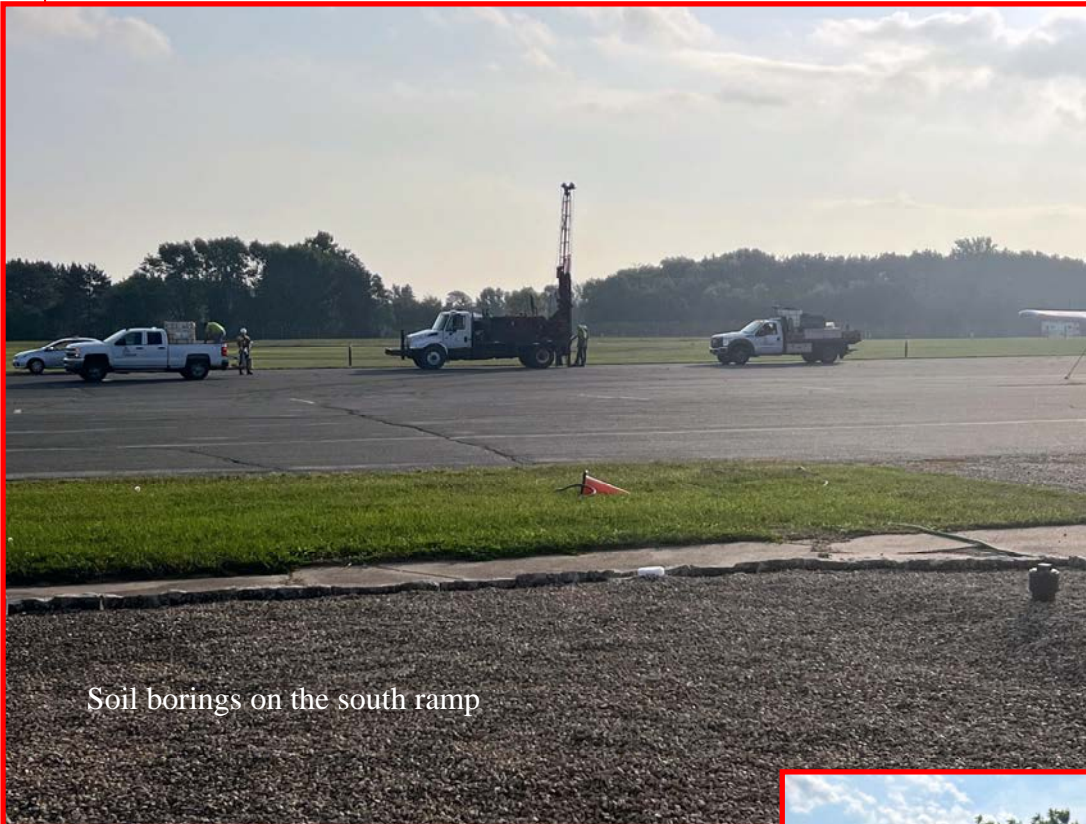
Soil borings on the south ramp

If you have been to the south hangar area recently, you probably noticed some activity related to the upcoming reconstruction project that is planned for next spring.